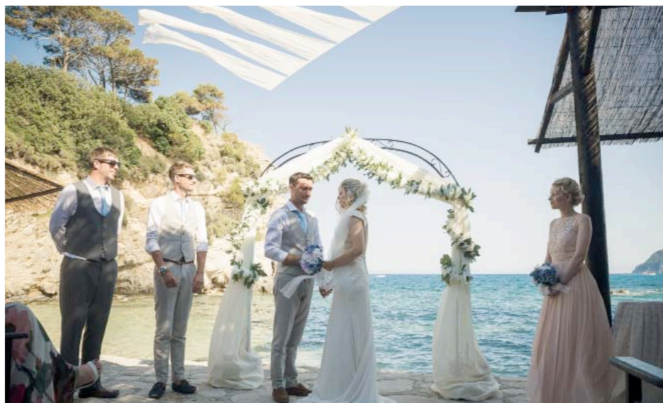
Stunning setting right by the waterfront