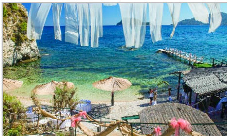
A very private venue